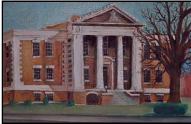
Painting of the Bristol Virginia Courthouse

The Bristol Historical Association will commemorate its 35th anniversary year with several events during the month of November. A general membership meeting will be held on Monday, November 10th at 6:30 pm at which charter members and former officers of the organization will be recognized.