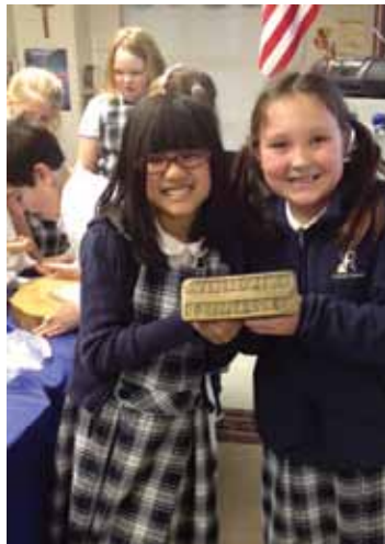
St Anne's students enjoy looking at a piece of the Pemberton Oak and other Bristol memorabilia during Bristol History classes.

The Education Committee is a vital part of the Bristol Historical Association. Volunteers go into elementary schools with a power point presentation telling the story of Bristol. Letters have gone out to all schools including Sullins, St. Anne's, the Morrison School, and Homeschoolers. Fourth grade students are targeted.