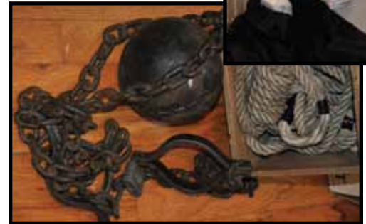
Margaret Mitchell Estate clothing, ball and chain for securing prisoners, and rope used for hanging in 1800's are some of the artifacts that will be exhibited at the November 16 meeting