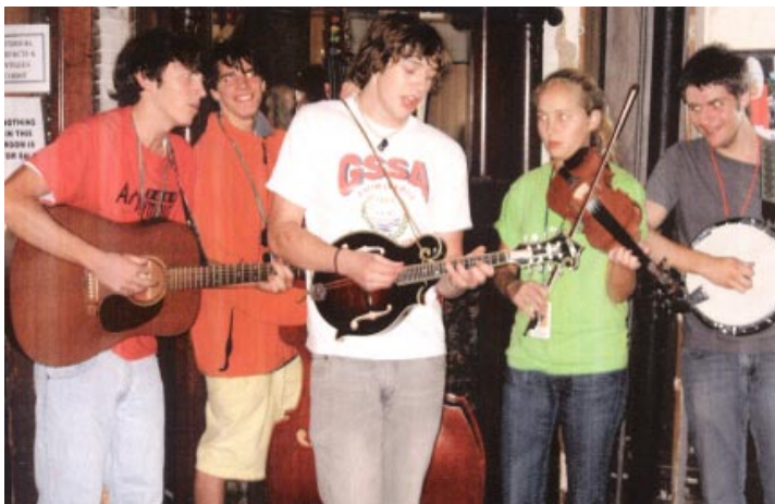
Green Bean String Band, Asheville, NC

Volunteers from the BHA and community at large combined with Committee members resulted in a total of 25 people staffing the Open House. Guest registry signatures numbered over 220, with actual attendance estimated at over 250. This event provided a wonderful opportunity to begin realizing one of the ultimate goals for this property, educating the community about local history, despite the house's currently unrestored state. Visitors who toured the house and exhibits came away enlightened of the multifaceted role it will ultimately play in the future as an integral part of Bristol's rich historic fabric and culture.