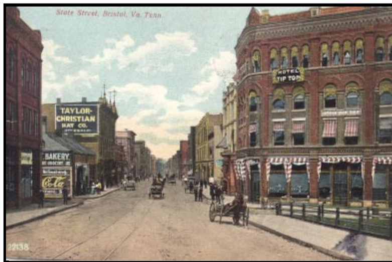
State Street, Bristol, Va.-Tenn., about 1909

The big residential expansion came in 1874 when Solar and Virginia Hills were opened for development. These were quickly by King's First Addition to the south, and the Burson-Delaney additions to the west. And here more than one hundred fifty years later Bristol continue to spread outward, further and further from her beginning point.